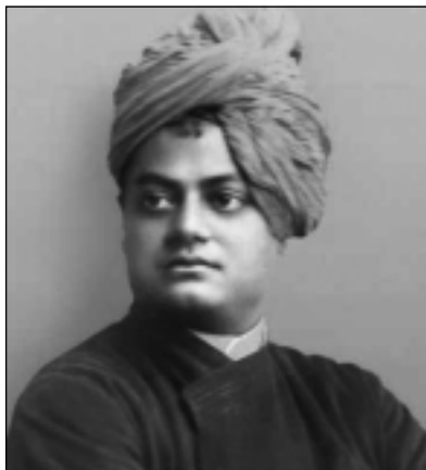
SWAMI VIVEKANANDA 12 January 1863–4 July 1902 Original Name- Narendra Nath Datta

No one was ever really taught by another. Each of us has to teach himself. The external teacher offers only the suggestion which rouses the internal teacher to work to understand things. Then things will be made clearer to us by our own power of perception and thought, and we shall realise them